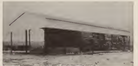
Pole hay shed.