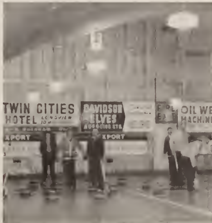
"You're that far off the broom."