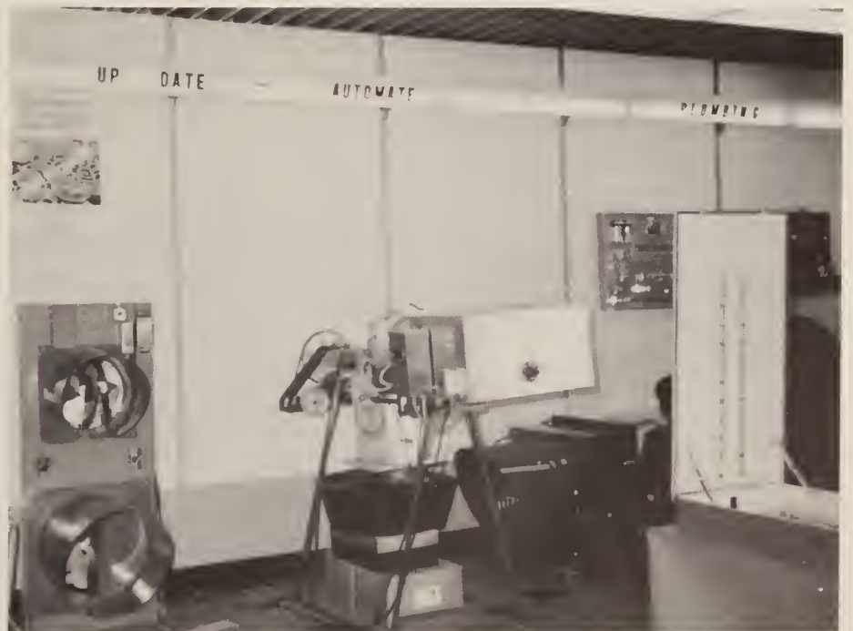
On display at the Calgary Farm Supply Centre — Ventilation Unit — Automatic Drop Feeding System by Henn-Rich.