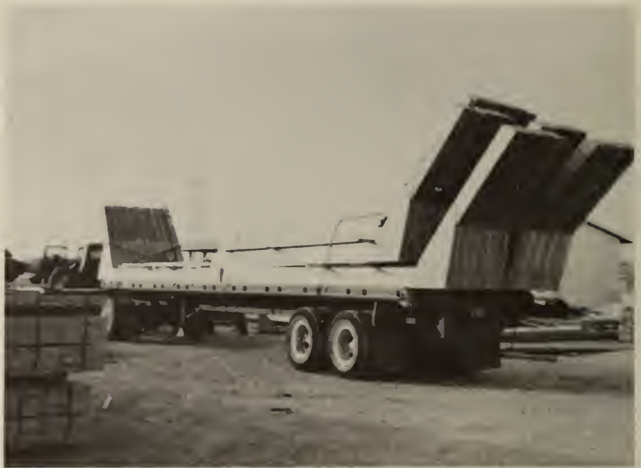
Truck load of Rigid Frame Rafters.

As anticipated, the initial acceptance of the Precut Service by the members of United Farmers was modest at the start. It was felt that it would be two years before the full value of the Precutting Plant would be evident.