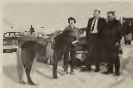
Price agreed on.