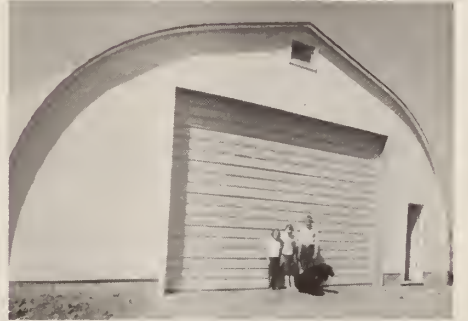
Arch Rib building.