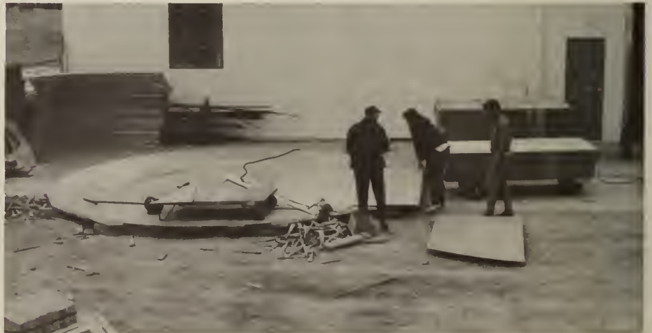
In production — a granary base.

In the latter part of 1963, the Building Supply and Precutting Services at the Calgary centre were expanded to provide a complete service which included erection of the building on the member's farm. This service had become necessary because of the chronic shortage of farm help. The extension of this department was expected to be continued more extensively over the years and a comprehensive building program was planned which would be available to all members.