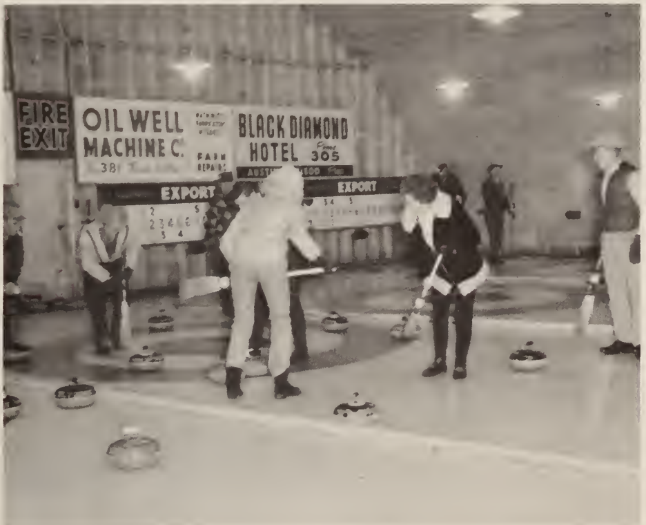
"And that little old rock going for shot stopped the black handles from counting six."