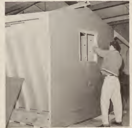
At work inside the plant.