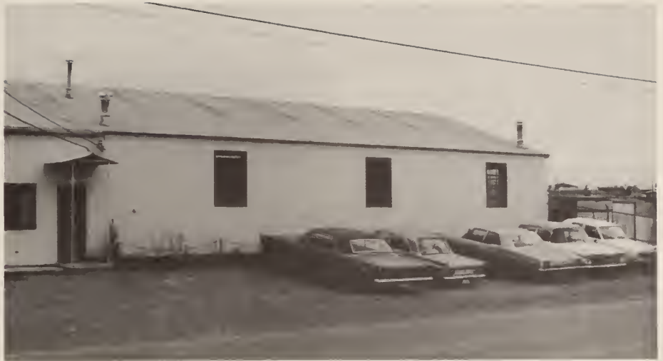
The Precut Building Plant in Calgary