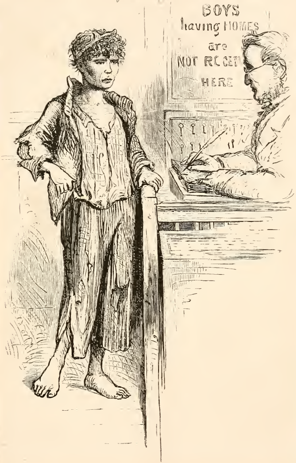
Plate from Life P. 772